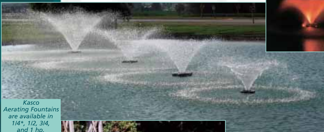
Kasco Aerating Fountains are available in 1/4*, 1/2, 3/4, and 1 hp.